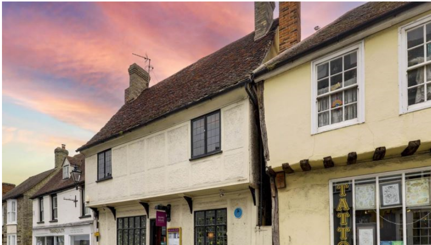
Royston, 10 Church Lane, Royston, Hertfordshire, , SG8 9LG