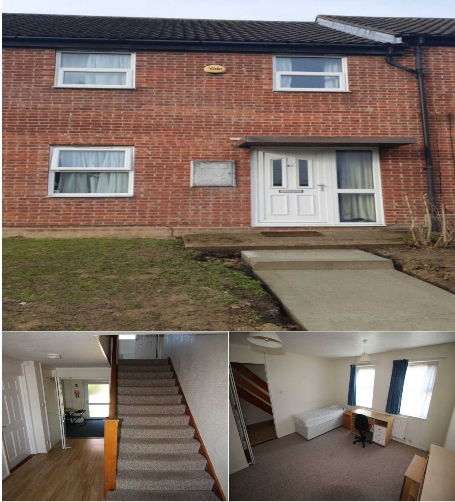
Avon Way , Colchester, Essex, CO4 3YJ

Rental £1,400 Monthly 4 Bedroom House Available 27 September 2024