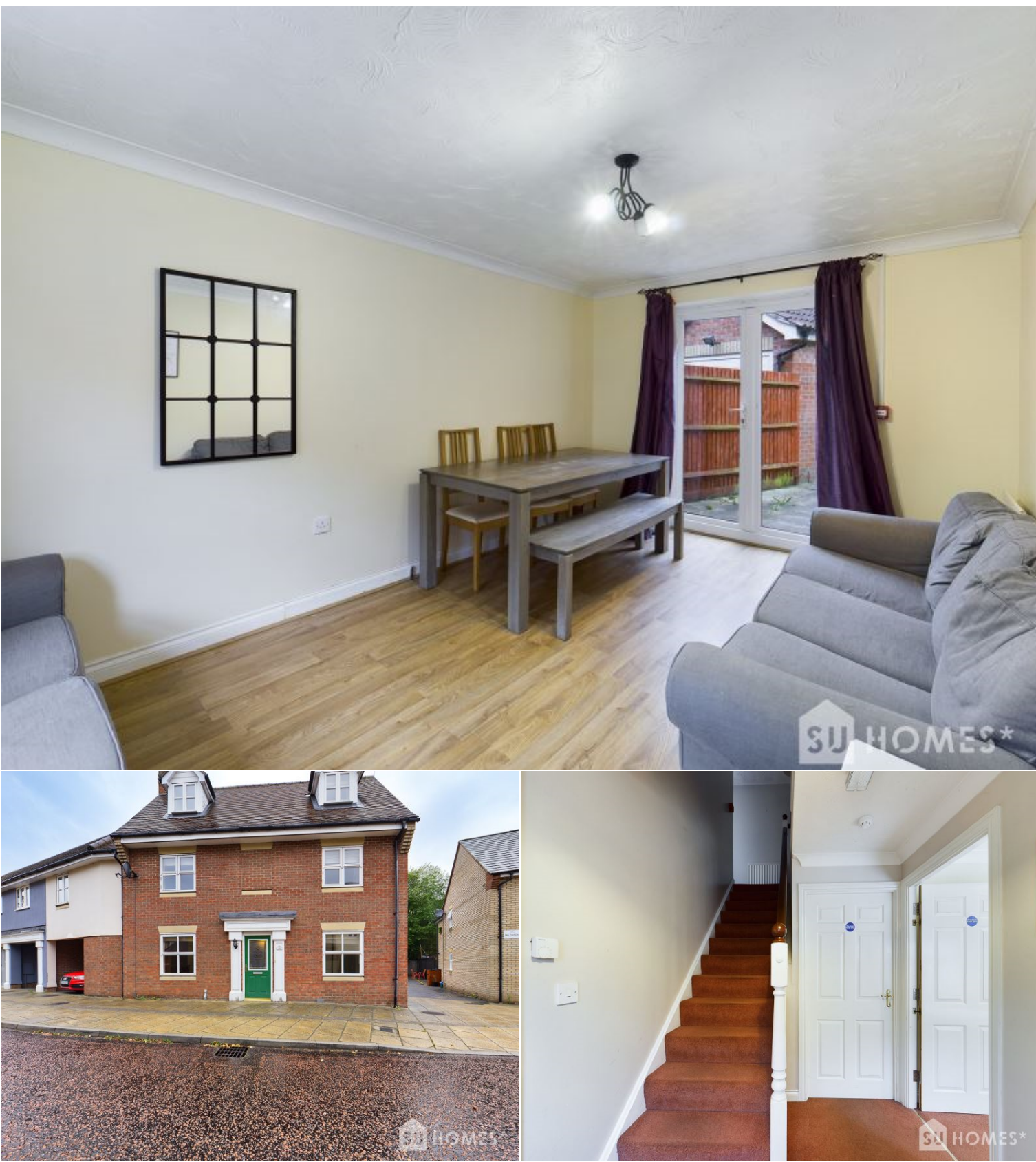
Hesper Road , Colchester, Essex, CO2 8JR