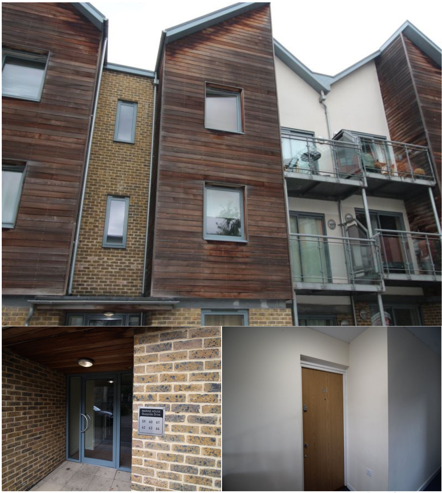
Marine House , Hythe, Colchester, Essex, CO2 8FX

Rental £850 Monthly 1 Bedroom Flat / Apartment Available 27 September 2024