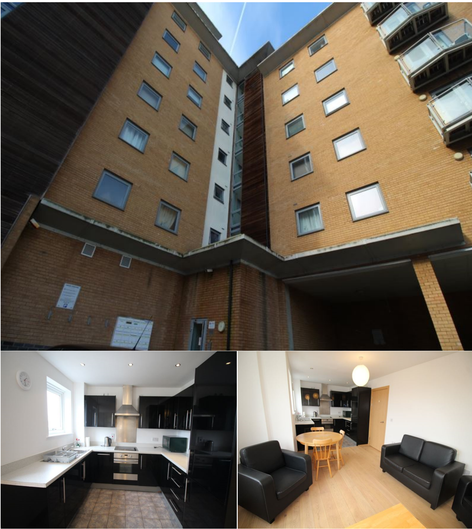
Caelum Drive , Hythe, Colchester, Essex, CO2 8FN

Rental £1,195 Monthly 2 Bedroom Flat / Apartment Available 17 September 2024