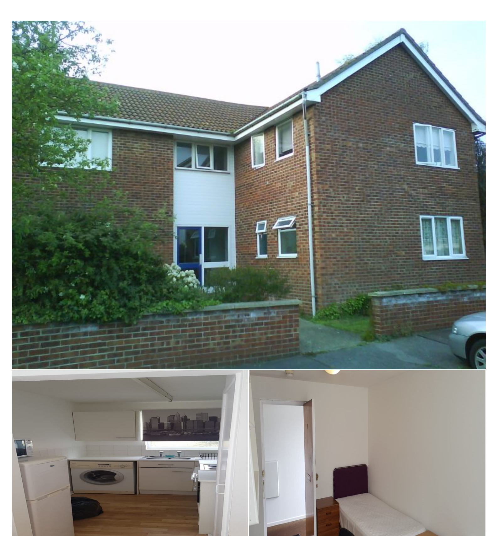
James Close , Wivenhoe, Colchester, Essex, CO7 9EY

Rental £675 Monthly 1 Bedroom Studio Available 15 September 2024