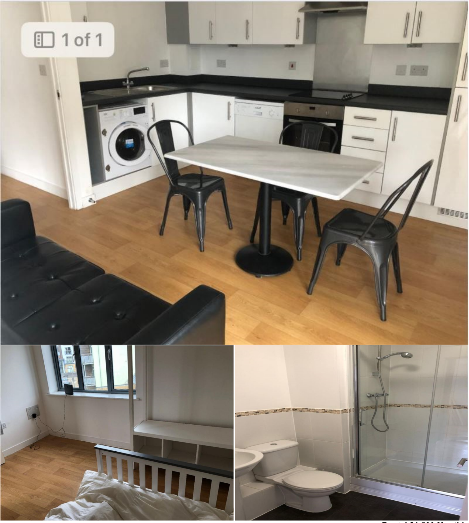
Pier Wharf , Colchester, Essex, CO2 8GN

Rental £1,500 Monthly 3 Bedroom Apartment Available 17 September 2024