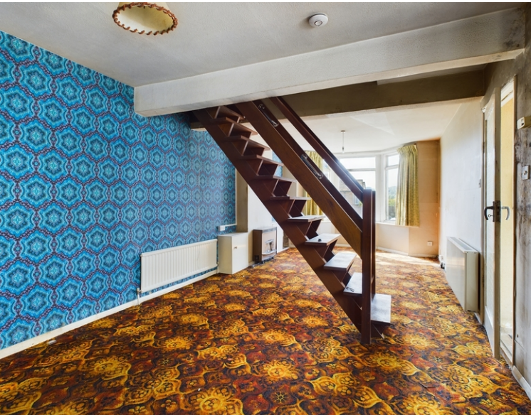
272 West Wycombe Road, High Wycombe, Buckinghamshire, HP12 4AB