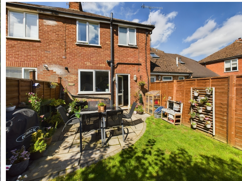
9 Lane End Road, High Wycombe, Buckinghamshire, HP12 4JF