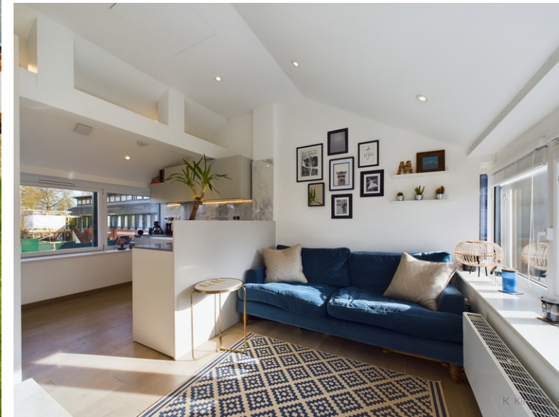
Flat 38, Uplands House, Four Ashes Road, Cryers Hill, High Wycombe, HP15 6DY