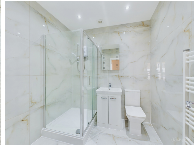
Flat 2 Stuart Lodge, Stuart Road, High Wycombe, Buckinghamshire, HP13 6AG