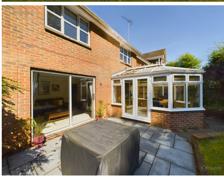
Badger Way, Hazlemere, High Wycombe, Buckinghamshire, HP15 7LJ