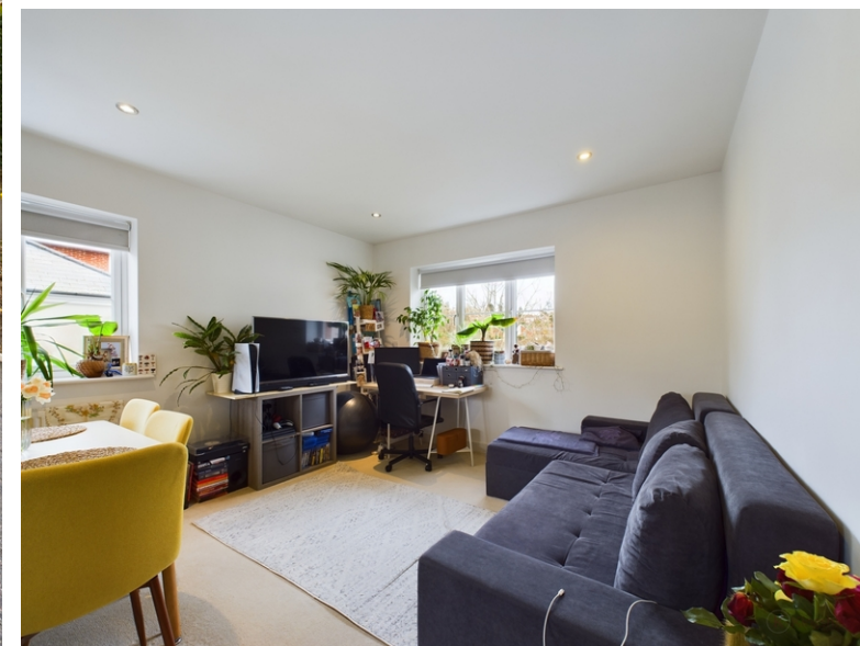
11 Sierra Road, High Wycombe, Buckinghamshire, HP11 1GX