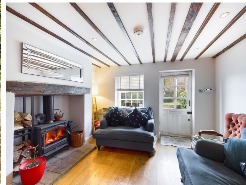
Sportsman Cottage, Speen Road, North Dean, High Wycombe, HP14 4NL