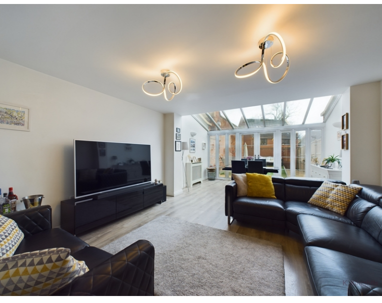
16 Kennedy Avenue, High Wycombe, Buckinghamshire, HP11 1BY