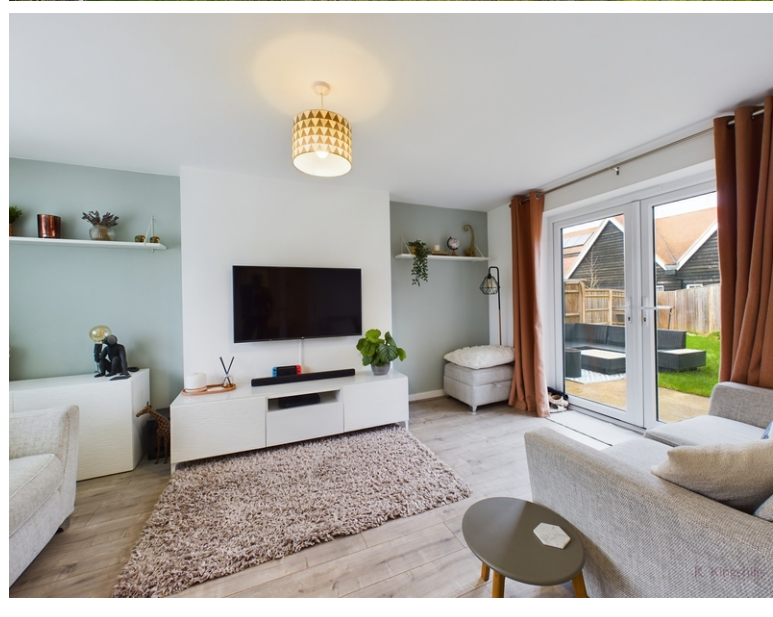
43 Wayfarers End, Longwick, Princes Risborough, Buckinghamshire, HP27 9FT