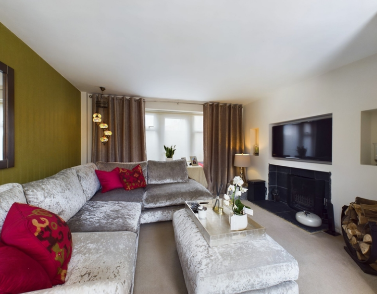
Earl Howe Road, Holmer Green, High Wycombe, Buckinghamshire, HP15 6PU