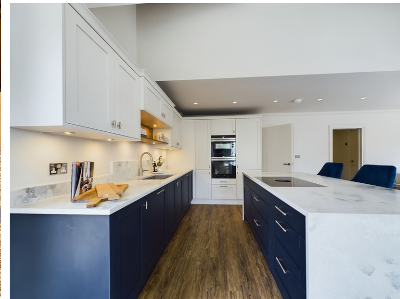
2 Appleyard Close, Whitchurch, Aylesbury, Buckinghamshire, HP22 4FX