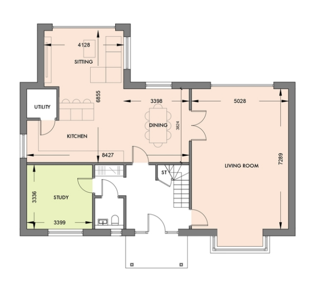
Flora, Chapel Lane, Naphill Common, Naphill, Buckinghamshire, HP14 4RF