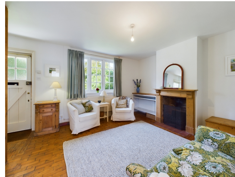
Melrose Cottage, Valley Road, Hughenden Valley, Buckinghamshire, HP14 4PE