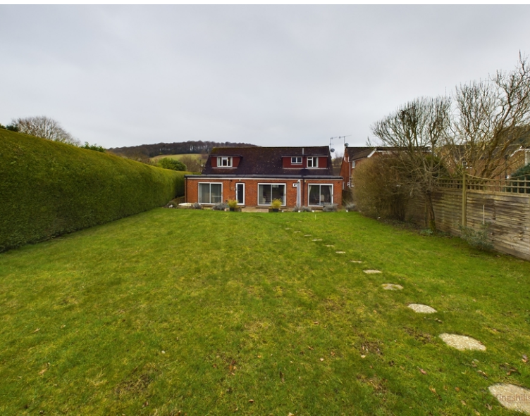
Kirklees, Warrendene Road, Hughenden Valley, High Wycombe, Buckinghamshire, HP14 4LY