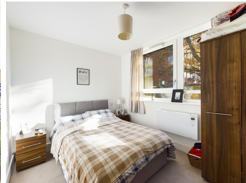
1 Castle House, Desborough Road, High Wycombe, Buckinghamshire, HP11 2FP