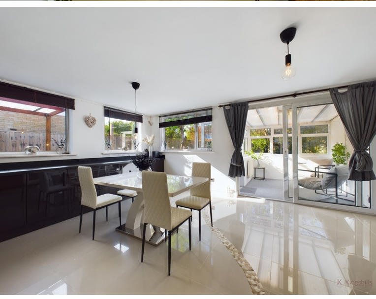
4 Dovecote Close, Princes Risborough, Buckinghamshire, HP27 9JU