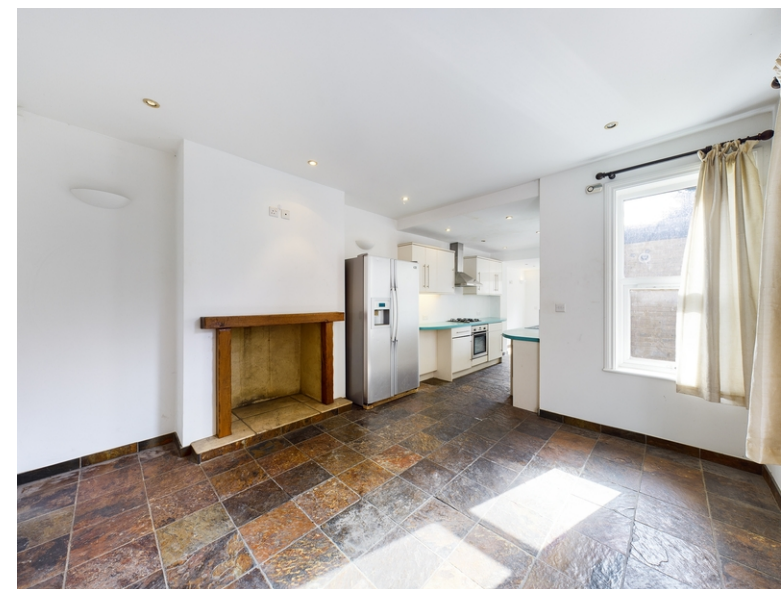
Queens Road, High Wycombe, Buckinghamshire, HP13 6AH