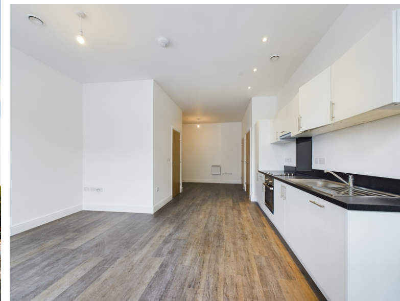
Flat 8, Birch House, The Old Works, Leigh Street, High Wycombe, HP11 2WP