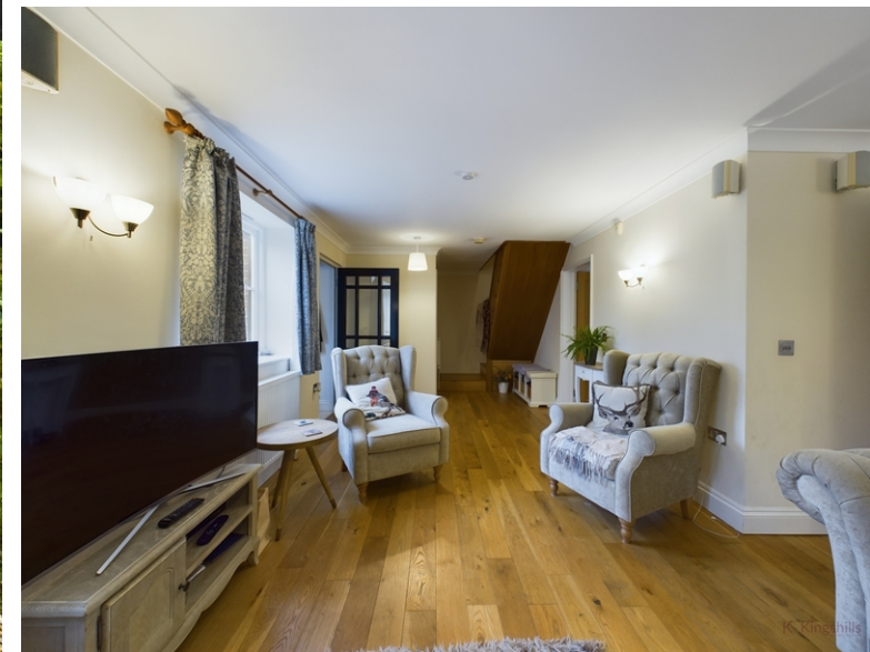
Beacon Hill, Penn, High Wycombe, Buckinghamshire, HP10 8NH