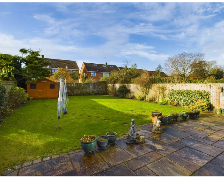
Ballyfar, Common Road, Great Kingshill, Buckinghamshire, HP15 6EZ