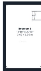
Floor 2 Building 1