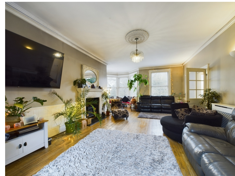
The Mount, 50 Amersham Hill, High Wycombe, Buckinghamshire, HP13 6PQ