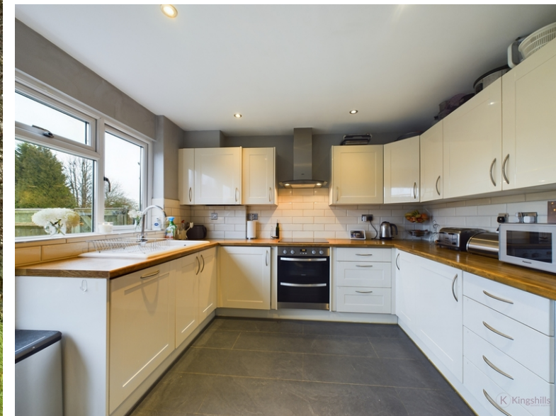
Hawthorn Crescent, Hazlemere, High Wycombe, Buckinghamshire, HP15 7PJ