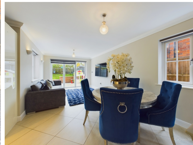
Denner Hill Cottage, Stonefield Road, Naphill, Buckinghamshire, HP14 4SP