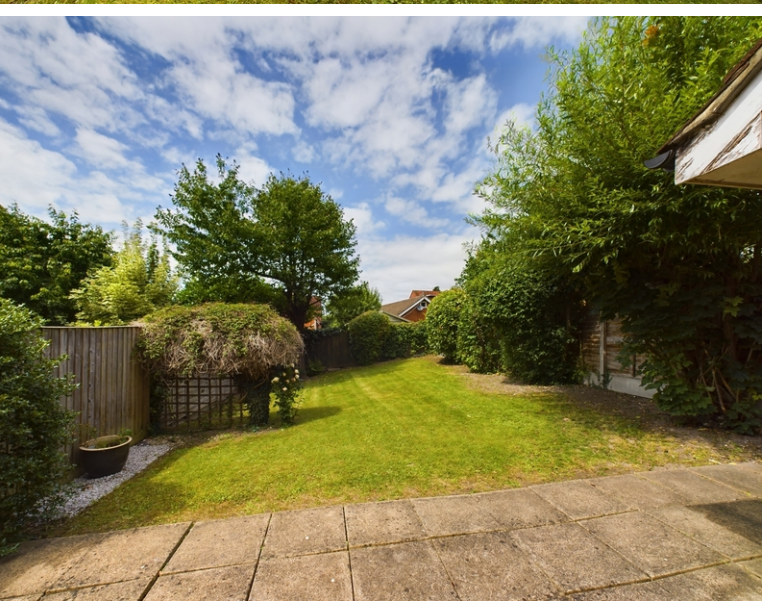
Thanstead Copse, Loudwater, High Wycombe, Buckinghamshire, HP10 9YH