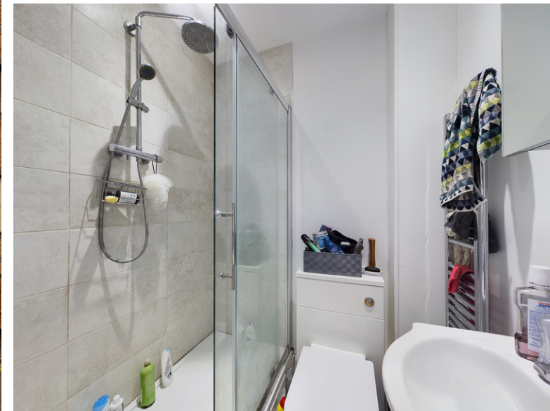
Sumner House Mendy Street, High Wycombe, HP11 2FF