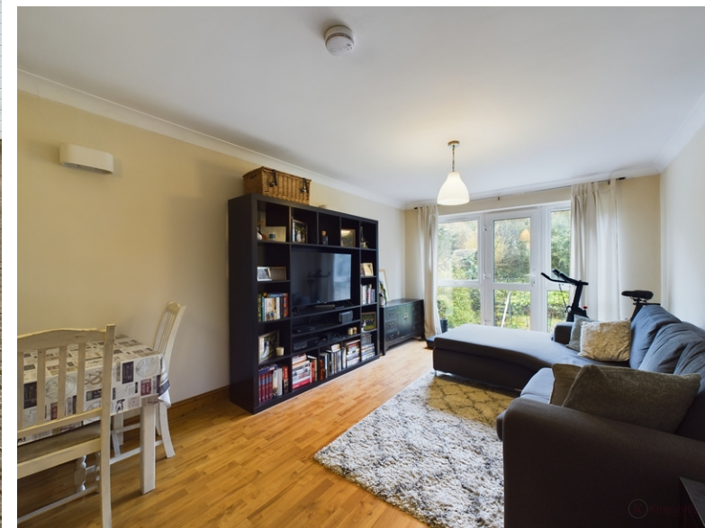
Martyrs Court, Station Road, Amersham, Buckinghamshire, HP7 0AX