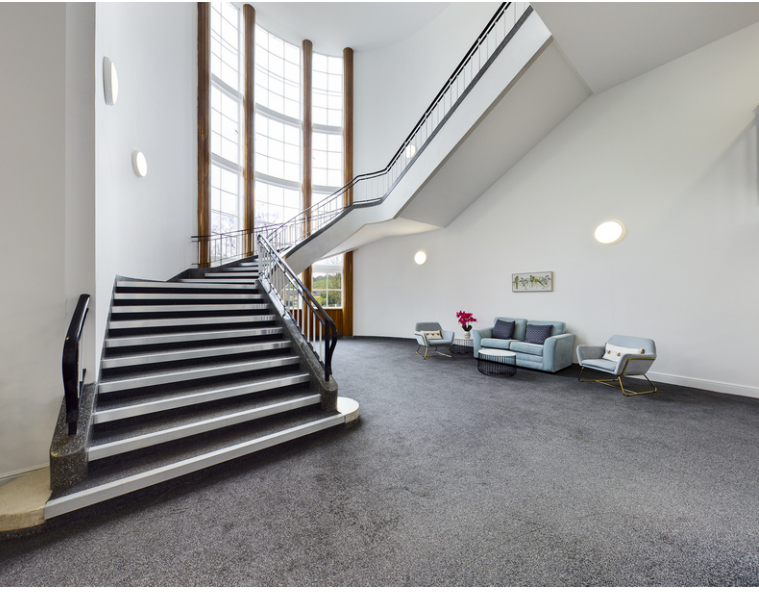
49 The Residence Wycombe Road, Saunderton, High Wycombe, HP14 4EA