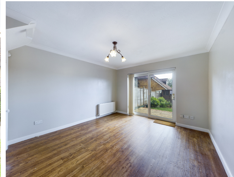
Elmhurst Close, High Wycombe, HP13 6DL