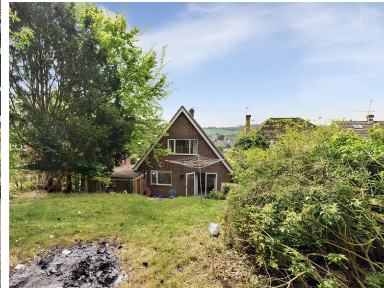
Friars Gardens, Hughenden Valley, High Wycombe, Bucks, HP14 4LT