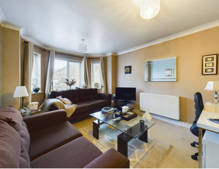
Flat 1 Dashwood House, Tavistock Mews, High Wycombe, Buckinghamshire, HP12 3BT