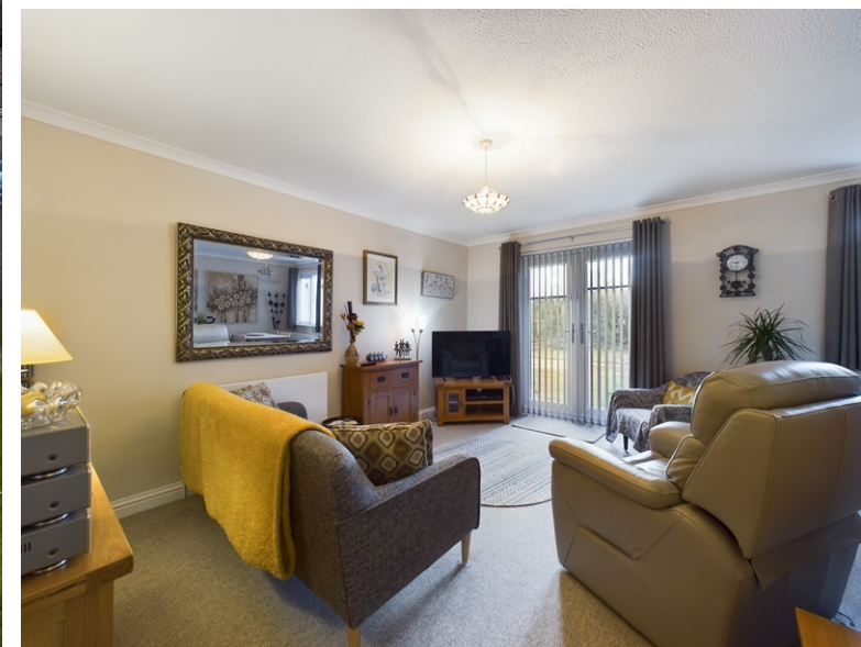
14 Milton Gardens, Princes Risborough, Buckinghamshire, HP27 9DD