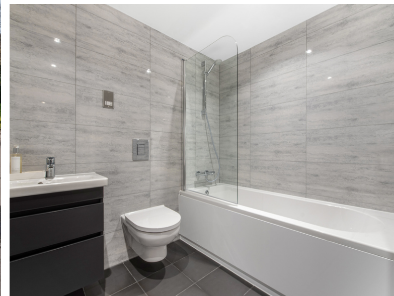
Flat 47, The Residence, Wycombe Road, Saunderton, High Wycombe, HP14 4EA